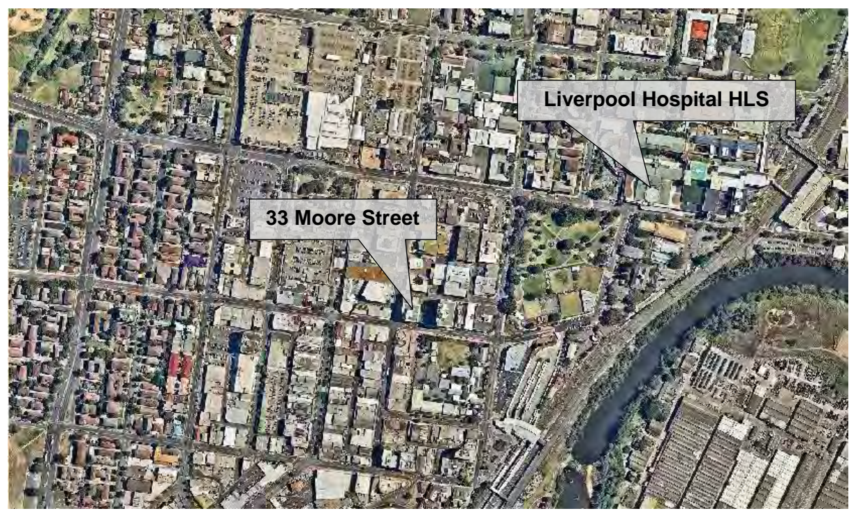
Figure 1: Liverpool CBD, and location of Liverpool Hospital HLS